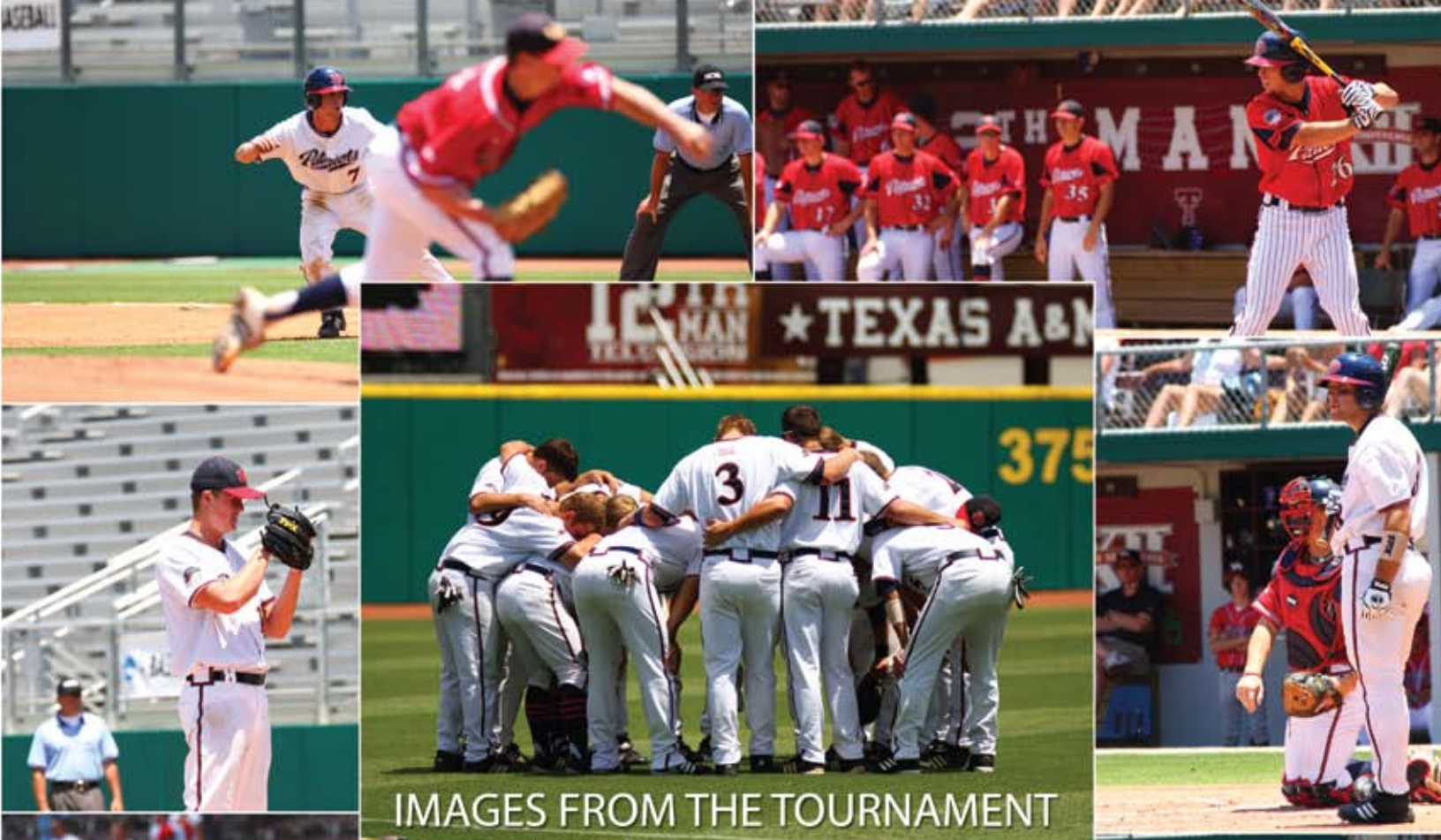
IMAGES FROM THE TOURNAMENT