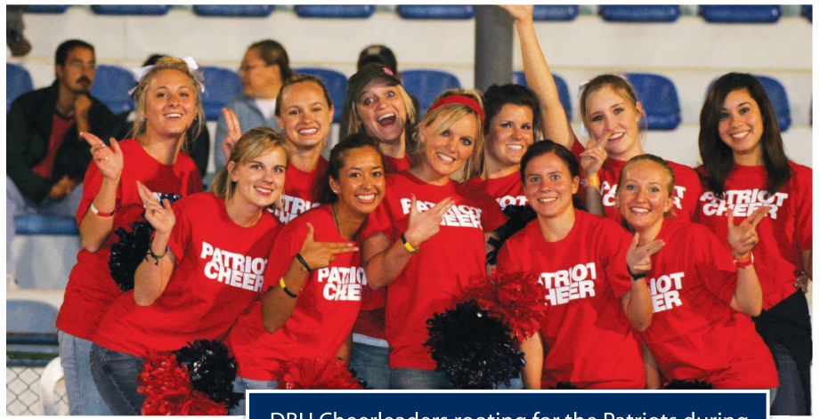
DBU Cheerleaders rooting for the Patriots during a game against the Guatemala National Team

"The greatest thing about the whole trip was that our players were able to share the difference that Christ has made in their lives with the boys from San Gabriel, the Guatemalan National Team, and every player that came to the clinics. We will continue to pray that the seeds that